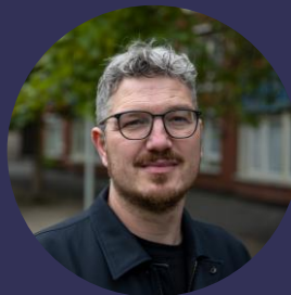
Arjen Kapteijns Deputy Mayor Energy Transition, Mobility, and Raw Materials